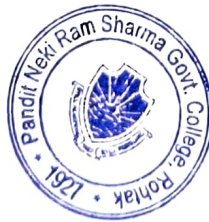
Principal Pt. N.R.S. Govt. College Rohtak