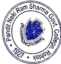
Principal Pt. N.R.S. Govt. College Rohtak